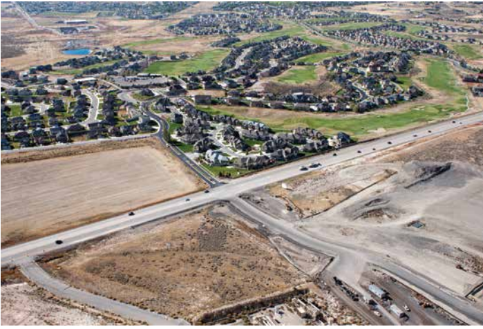
Current S.R. 73 near Mt. Airey Dr.