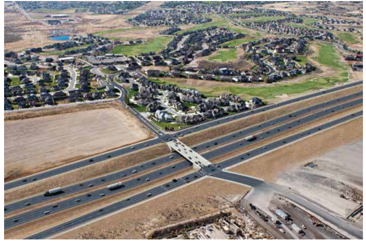
Freeway with Frontage Roads concept visualization near Mt. Airey Dr.